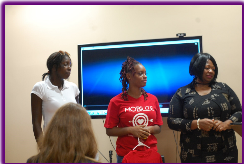
disABILITY LINK/AAPD Summer Interns