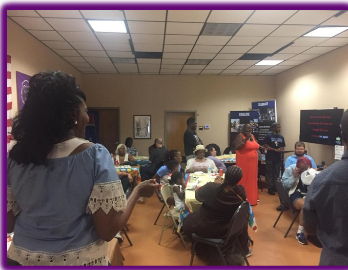
Annual Family & Friends Picnic Staff and Friends doing karaoke